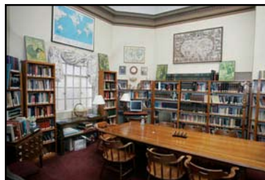
Newly designed Raphael House Library