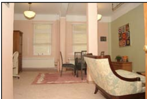
Teen Room Designed For Comfort and Dignity

San Francisco philanthropy shone this week as privately funded Raphael House received a high-end makeover from some of the classiest design mavens in town.