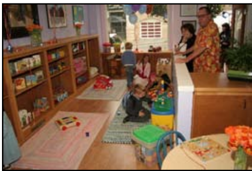
Raphael House Playroom Rebirth

San Francisco philanthropy shone this week as privately funded Raphael House received a high-end makeover from some of the classiest design mavens in town.